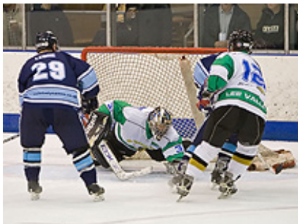
Lee Valley Lions in Action

You are in: London > Sport > Other Sports > Lee Valley Lions